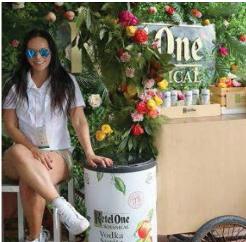
WINDWARD VIP EXPERIENCE BAHIA MAR YACHTING CENTER

The 64th annual Fort Lauderdale International Boat Show will be held October 25 - 29, 2023 in the Yachting Capital of the World. Owned by the Marine Industries Association of South Florida (MIASF) and produced by Informa Markets, the Fort Lauderdale International Boat Show (FLIBS) is recognized as the largest in-water boat show in the world. FLIBS spans more than three million square-feet of exhibit space across seven waterfront locations that are connected by an intricate network of water and ground transportation services. The five day show attracts over 100,000 attendees and 1,000 exhibitors representing 52 countries with more than 1,300 boats on display.