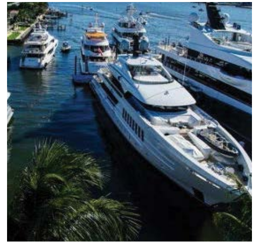
SUPERYACHT VILLAGE PIER 66 MARINA PIER SOUTH

The AquaZone is an exciting and engaging attraction designed to give boat showgoers an upfront and personal experience with various water sports and innovative marine products.