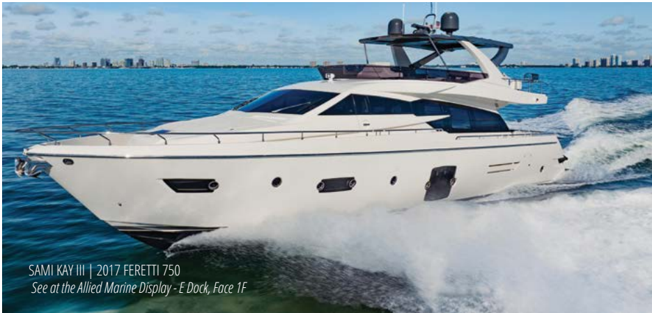
SAMI KAY III | 2017 FERRETTI 750 See at the Allied Marine Display - E Dock, Face 1F