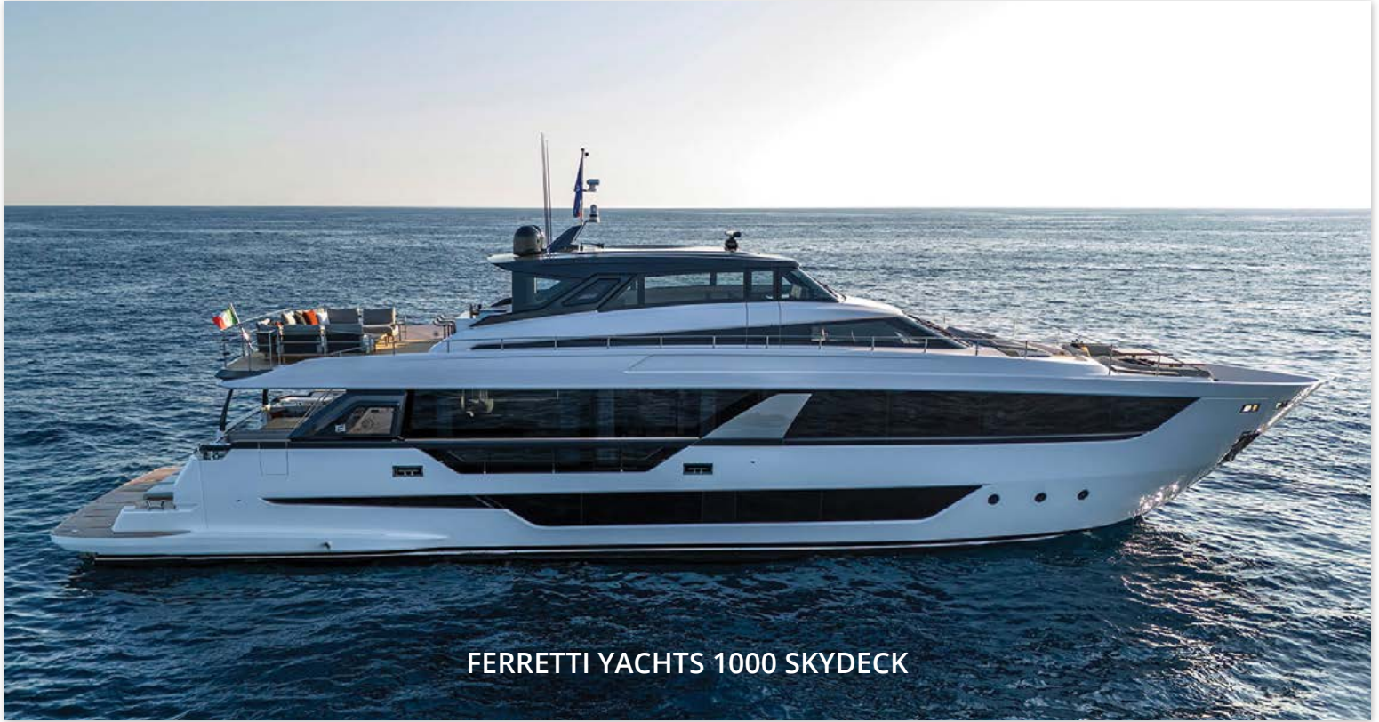
FERRETTI YACHTS 1000 SKYDECK