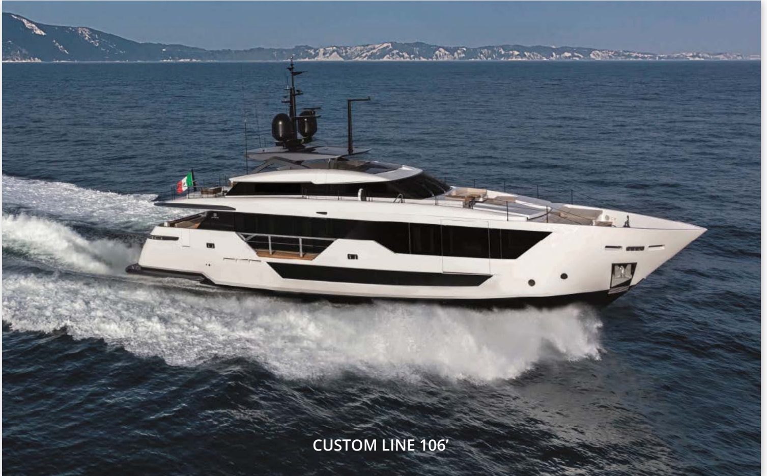
CUSTOM LINE 106'