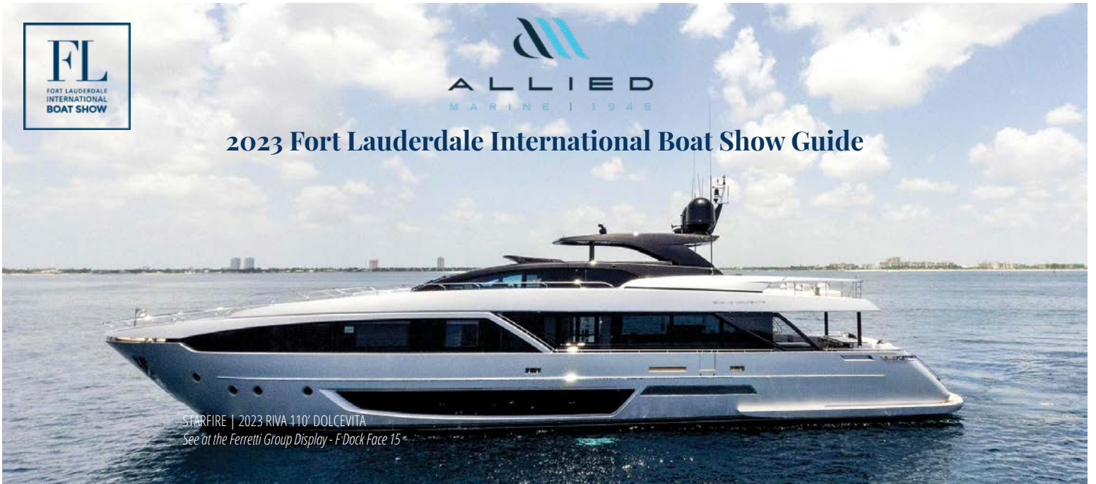
STARFIRE | 2023 RIVA 110" DOLCEVITA See at the Ferretti Group Display - F Dock Face 15