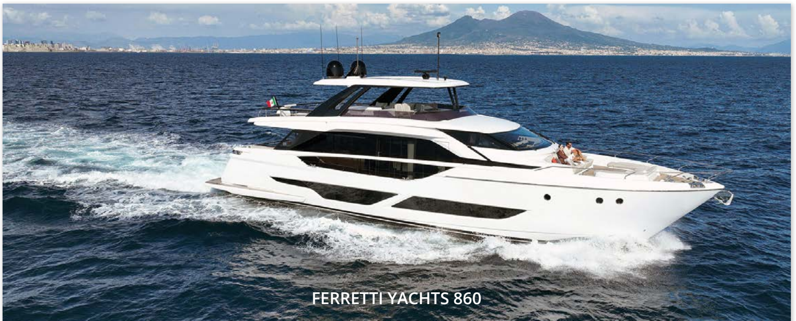
FERRETTI YACHTS 860