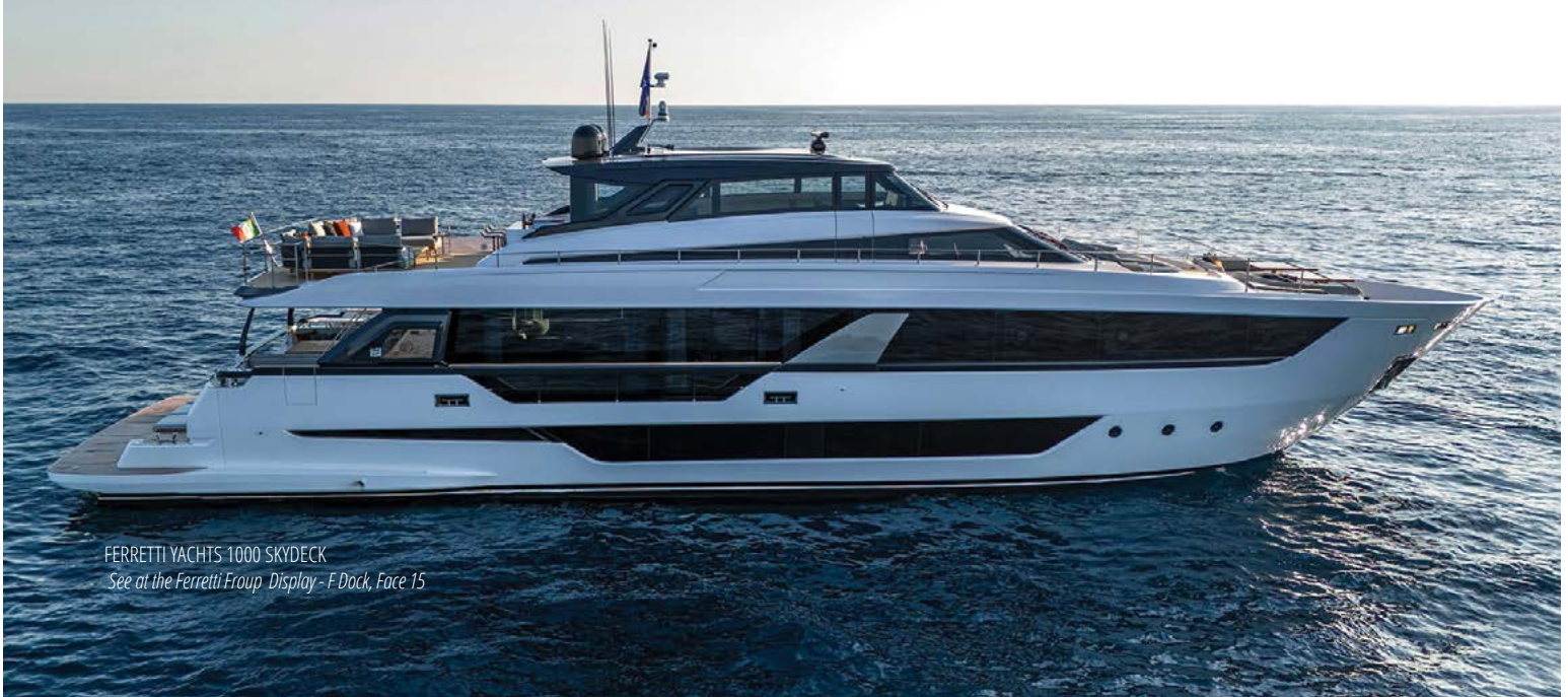
FERRETTI YACHTS 1000 SKYDECK See at the Ferretti Group Display - F Dock, Face 15