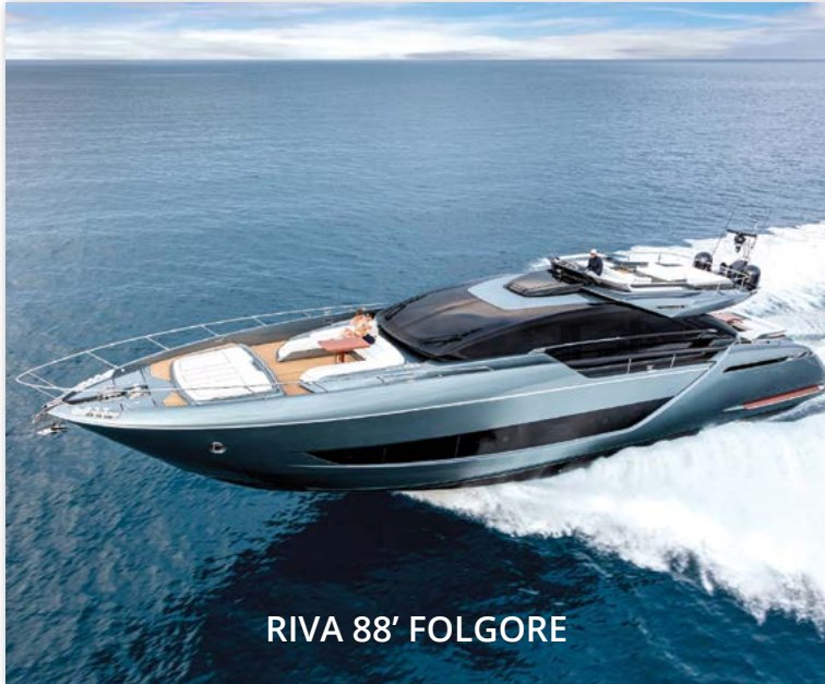
RIVA 88' FOLGORE