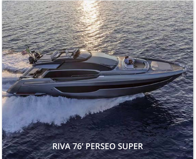
RIVA 76' PERSEO SUPER